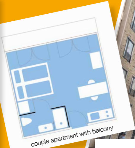
couple apartment with balcony