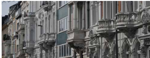
Flat share surroundings