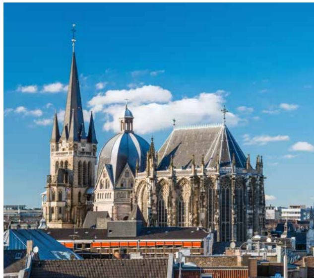
Apartment and Bourding House surroundings